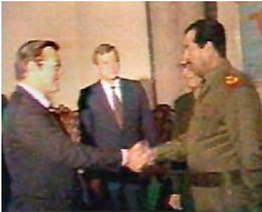
Donald Rumsfeld, Envoy to Iraq 1983

During the Iran-Iraq war, the U.S. provided Iraq with economic aid, weapons, and the materials for biological and chemical weapons. These included $5 billion in agricultural credits, as well as $684 million to build an oil pipeline through Jordan (Construction to be undertaken by Bechtel Corporation). Saddam launched an attack on the Kurdish town of Halabja where Kurds had begun a revolt. The gas attacks killed 6,800 people. Ironically Saddam would later be tried and convicted for this U.S. supported massacre. Overall during the war, more than a million people lost their lives, 400,000 from Iraq alone.