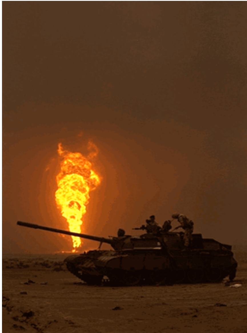
25/3/91 Al Maqwa, Kuwait

In 1991, the U.S. launched Operation Desert Storm, a massive invasion against Iraq. During the six-week long invasion, 1000 bombing runs were made per day, 250,000 people were massacred, and Iraq's infrastructure was left in ruins. Ammunition rounds used in combat contained depleted uranium, a heavy and dense metal made from spent nuclear fuel. Low levels of radiation in the metal can become extremely toxic after weapons are fired, and the radioactive material gets dispersed into the air and dust. Depleted uranium has been linked to increased cancer rates in both the Iraqi population and in Gulf-War veterans.